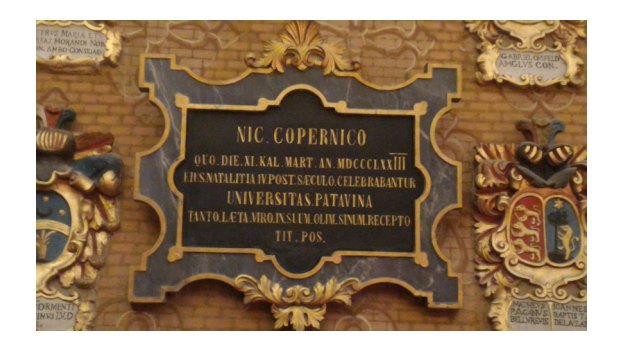
FIGURE 1. Inscription on the right wall of the great-hall of the University of Padua

This is positioned on the right-hand side wall in the great-hall of the University, located in the Palazzo Bo , the main building that has hosted the rectorate since the fifteenth century. The plate, in the form of golden characters on a black background (see Fig. 1), is surrounded by other plates donated to the University by students after they completed their studies Fig. 2.